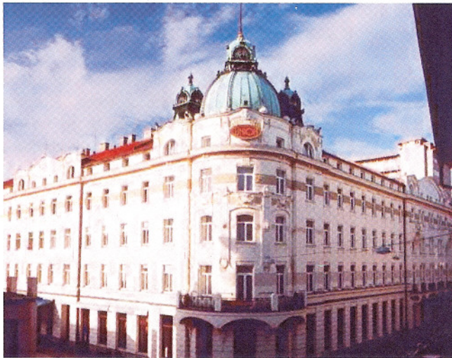
Grand Hotel Union

You are kindly invited to a guided tour of Ljubljana on Tuesday November 5 th . Meeting point is in the Lobby of the Grand Hotel Union at 6 pm.